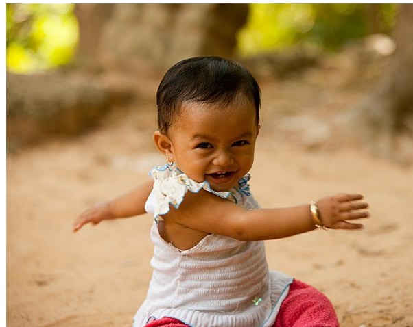
Twist your arms from side to side