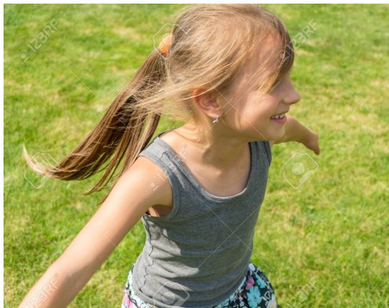
Twirl around 2 times